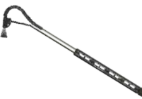
ADJUSTABLE LANCE to an angle of 20° to 140°