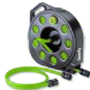
WATER HOSE 15 m extension