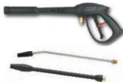
PISTOL GRIP + LANCE