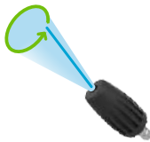
ROTARY PRESSURE CLEANING NOZZLE 360° of high pressure